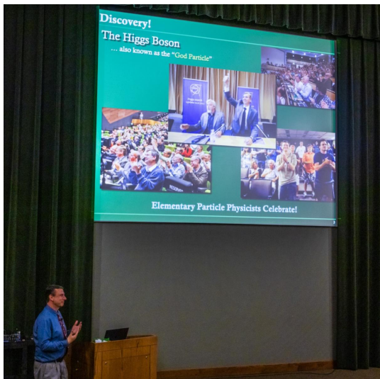
LLL members enjoy the lecture about "The God Particle" at January's coffee.

NOTE: The 2023 Christmas luncheon is scheduled for December 8th at the Cashion Academic Center. Information for the program and tickets will be available in the fall on the Mayborn/LLL website.