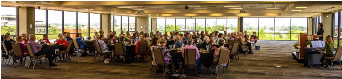
Spring Luncheon at the Cashion