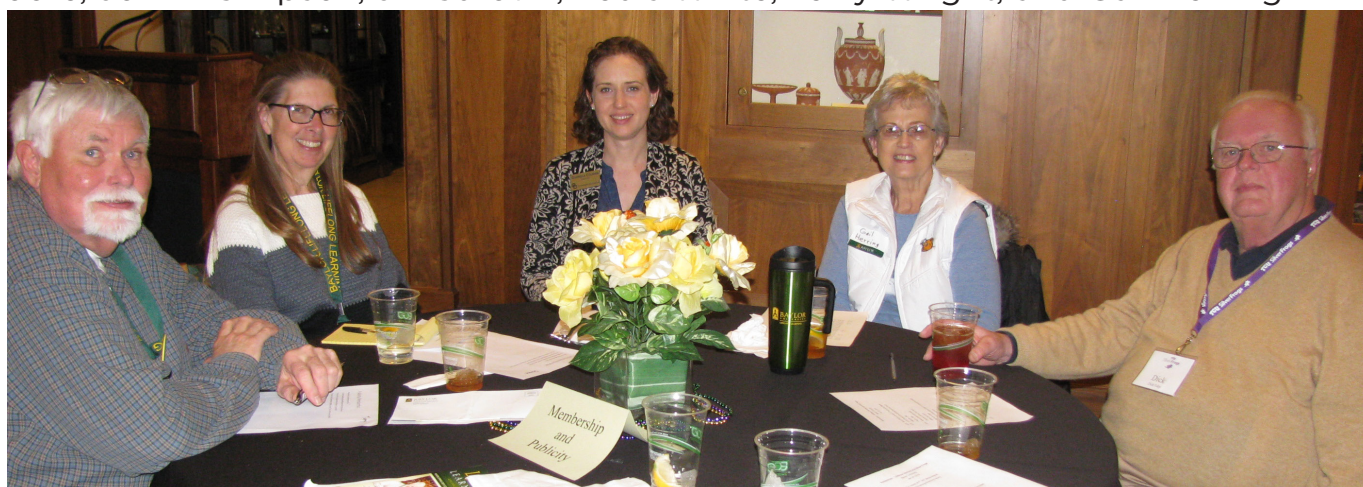
LLL and Silver Frog Publicity Committees to share ideas and future plans.