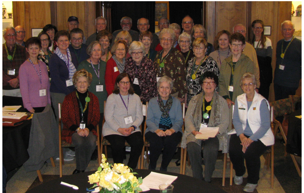
LLL-Silver Frog Symposium

We are excited about moving into the future. Join us in continuing the legacy of Baylor Lifelong Learning.