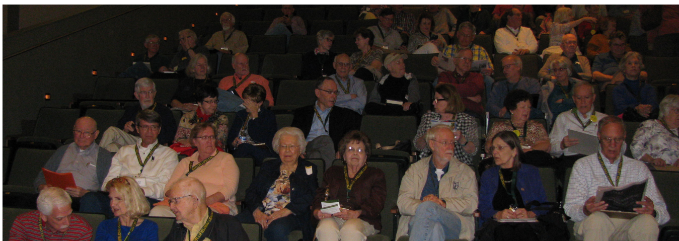
The Curriculum Committee planned WWII History course, which had record attendance.